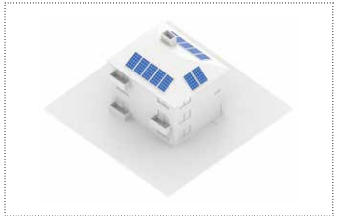
Multiple orientations, no problem: Installers can now use roof space on multiple sides of a home to generate power.