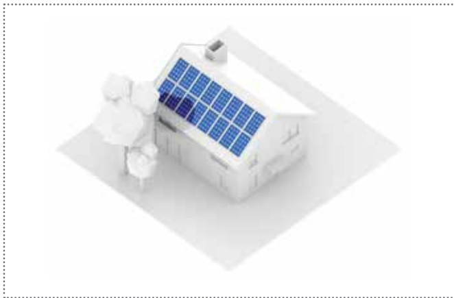
Partial shading: One MPP tracker per module ensures optimal energy production, even with dynamic shading.