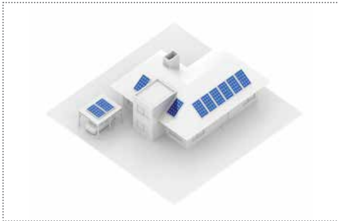
Optimal use of roof surface: Complex roof configurations can be used to maximize system output without impacting the rest of the system.